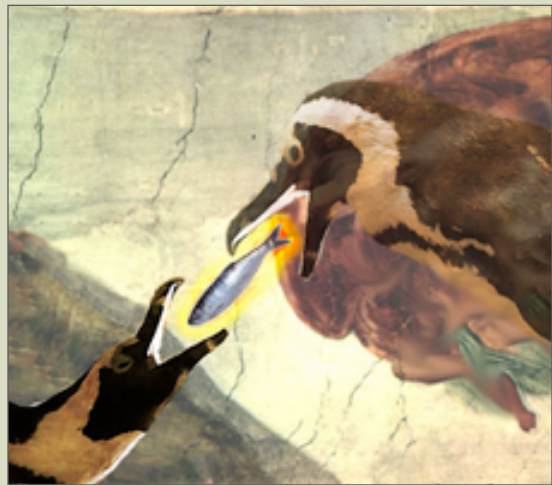
THE GREAT PENGUIN REGURGITATES THE HERRING OF LIFE TO THE FIRST PENGUIN